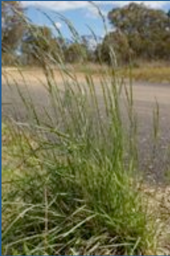
Tall fescue