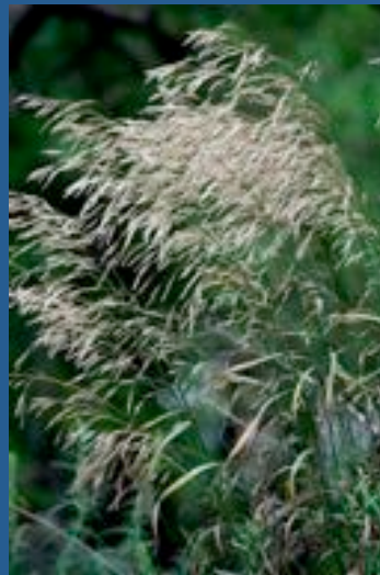
Smooth brome (Berkeley)