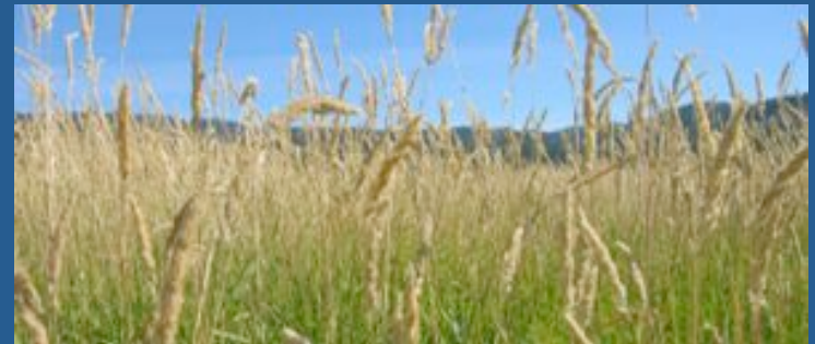
Crested wheatgrass