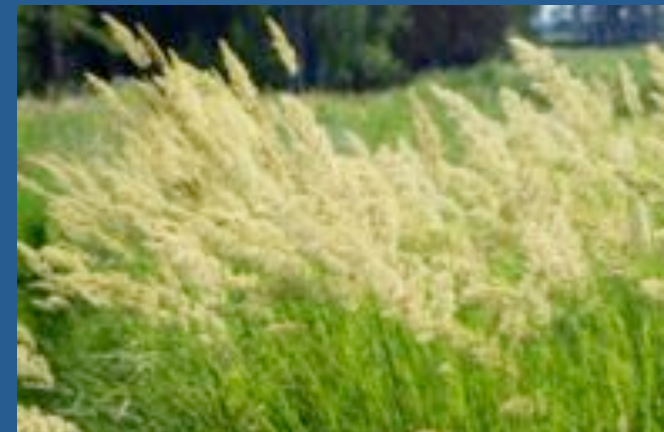
Orchard grass