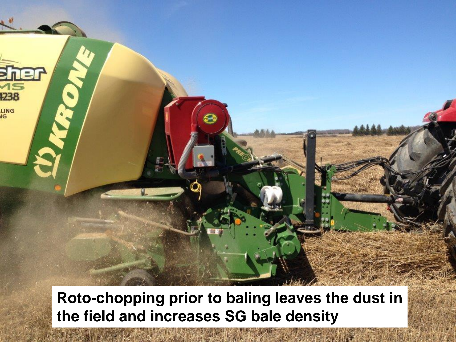
Roto-chopping prior to baling leaves the dust in the field and increases SG bale density