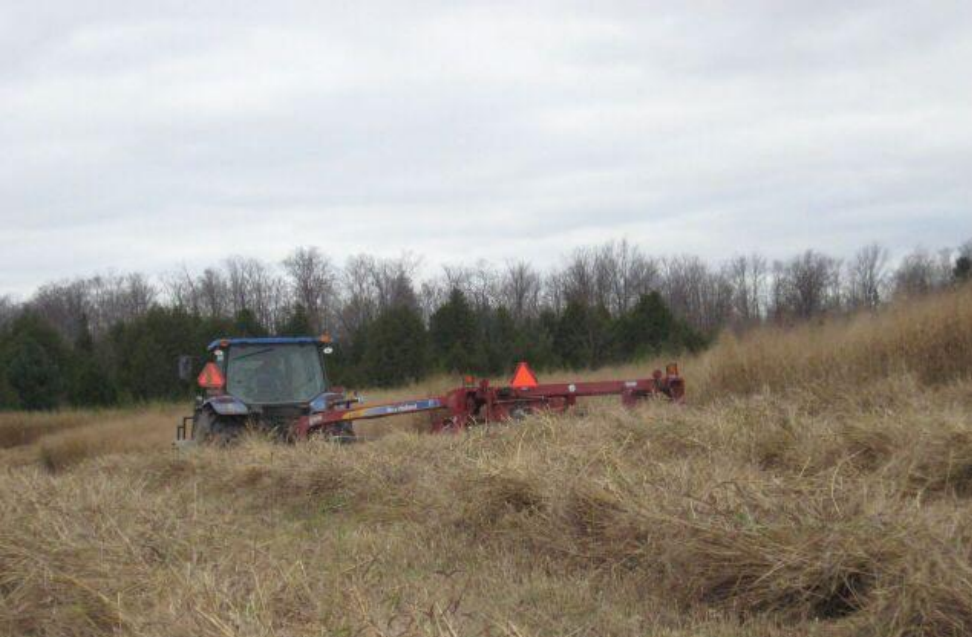
The biomass crop is generally mowed after the first killing frost in late fall (~Nov. 1)