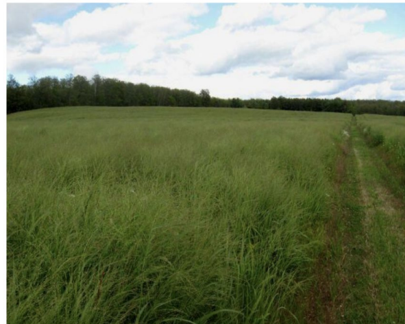
Figure 4: Large switchgrass fields provide nesting sites and cover for grassland bird species, decreasing predation when compared to annual crops. Increases in biodiversity are also seen through greater abundance and diversity of insect and pollinator species. (2)

A major reason for the support of biomass crops can be attributed to the environmental benefits they provide. As a carbon neutral and renewable energy source, PBCs reduce greenhouse gas (GHG) emissions derived from the agriculture sector by replacing fossil fuel combustion with biomass energy (16). Specifically, when biomass crops are grown on lower agricultural class lands, they play an important role in GHG mitigation by sequestering carbon into soils through organic matter inputs, increasing soil organic carbon pools (8, 4). Long term studies have demonstrated that marginal lands converted to biomass crops show higher gains in soil organic carbon than fertile lands, indicating the importance of converting marginal lands to PBCs (17). The integration of carbon into soils also positively influences the overall fertility and productivity of agricultural lands while the deep rooting systems of PBCs improve the soil structure, stability and health. (18) The deep rooting systems of switchgrass and miscanthus prevent significant soil erosion and help to prevent sediment and nutrient loading in nearby waterways while their reduced fertilizer needs, and high nutrient use efficiency contribute to decreased groundwater contamination (7, 14). The reduced tillage and pesticide use associated