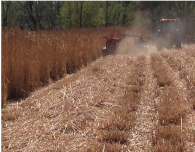
Figure 3: Miscanthus crop being harvested. Biomass left on the field will protect soil from erosion over winter. (3)

April, as the majority of southern Ontario receives sufficient Growing Degree Days (GDD) for successful establishment (3).