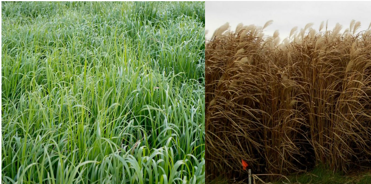
Figure 1: Switchgrass crops (left) and miscanthus crops (right) growing in Ontario, Canada. (2,3)

Perennial biomass crops (PBCs) are fast growing herbaceous grass species with the ability to contribute to the production of biomass energy. They are a renewable and carbon neutral energy source, where electric power is created by burning of organic material (1). Perennial biomass crops, namely switchgrass and miscanthus, are becoming increasingly popular in Ontario due to their ability to produce high biomass yields with little inputs and low soil nutrients, while improving soil health (2). The growing biomass and renewable energy sector are creating increased demand for biomass crops, providing a sustainable economic avenue for farmers, especially on marginal or degraded lands (2). The integration of biomass crops into Ontario's agricultural community is an economically and environmentally conscious decision.