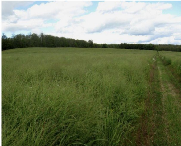
Figure 4: Large switchgrass fields provide nesting sites and cover for grassland bird species, decreasing predation when compared to annual crops. Increases in biodiversity are also seen through greater abundance and diversity of insect and pollinator species. (2)